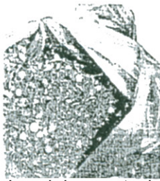
Local dagga stash