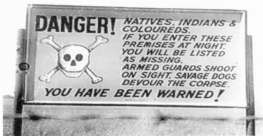
A poster from the 1950s.

7 Study the poster and then answer the questions which follow.