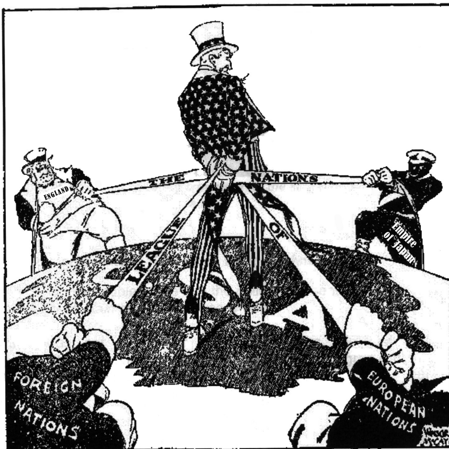
A cartoon from the 1920s.

2 Study the cartoon and then answer the questions which follow.