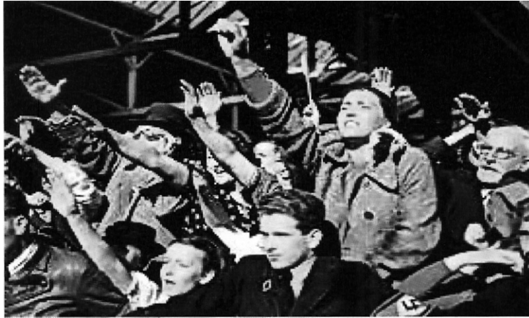
A photograph of Austrians cheering the arrival of the German soldiers in March 1938.